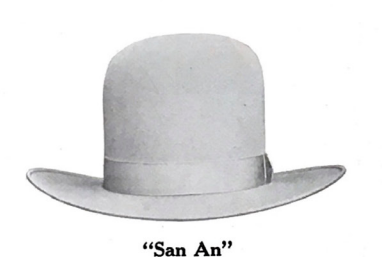
The regular San An style in Shipley's special quality. Crown, 6½ inches; brim, 3½ inches. Color, tan. Price........$8.00