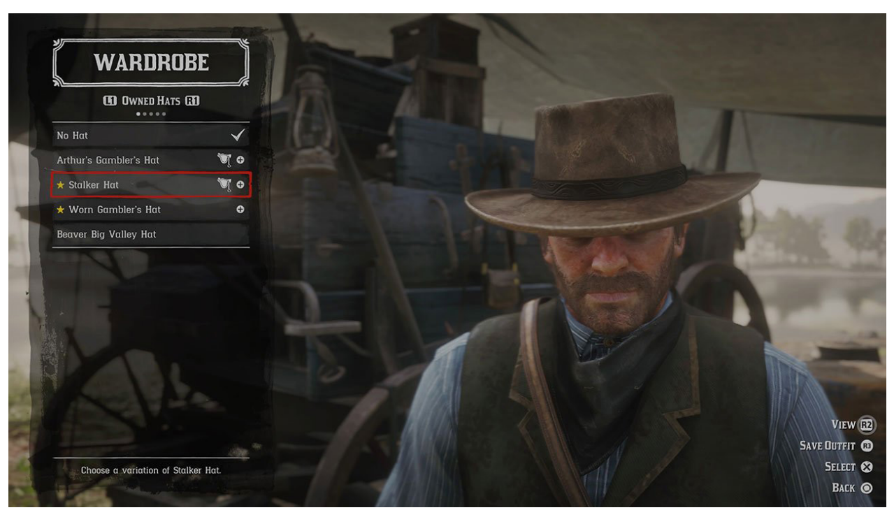
Illustration 1 : Donning video game hats. Screenshot from Red Dead Redemption 2.

ied mobility also extends to representational forms. Western hats have gained their potent symbolism and transnational recognizability not only on account of their wearable materiality, but also their intermedial migrations from the printed page to the digital worlds of video games; indeed, they are intermedial monads (Illustration 1). Trying to ascertain the etymological origins of the expression—"a ten gallon hat"—Peter Tamony has offered the following pleonasm: "One of the apt and incontrovertible definitions of a human being is 'one who wears a hat." In other words, a western hat is iii) a visible and obvious marker of identity. In the same vein, fashion historian Ann Saunders has observed that "when you meet people, you look them in the face and your first most immediate impressions about them are received from the head and from anything that your acquaintance, new or old, may have chosen, or needed, to put upon it." <sup>14</sup>