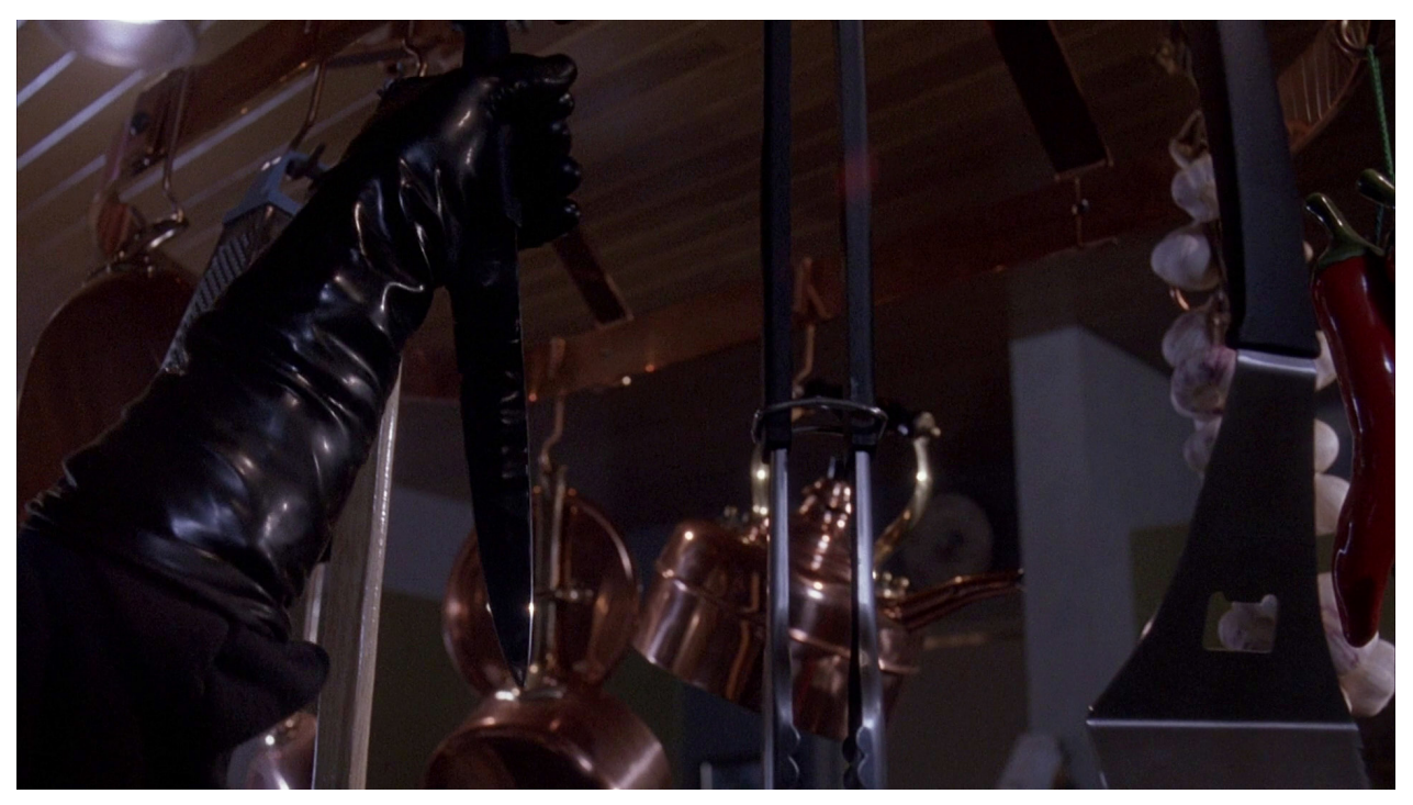
Illustration 4 : The "videogame" looks like a movie. Frame grab from Brainscan

In the gamespace, Michael approaches a stereotypical suburban home. He discovers an unlocked side entrance, takes a large knife in the kitchen, and proceeds to the bedroom, where he slaughters a middle-aged man before taking the man's tattooed right foot as a souvenir, which Michael finds in his actual fridge several hours after having stopped playing the game.