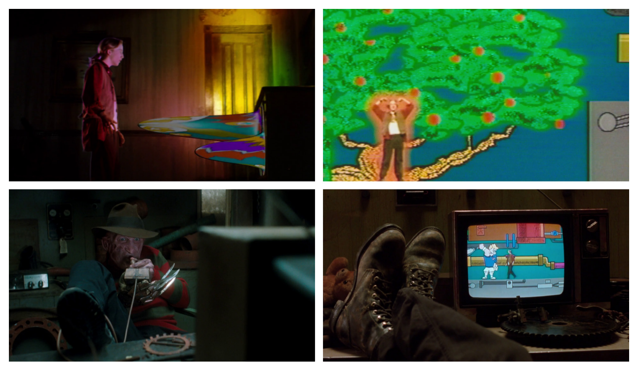
Illustration 1 : After a character has been sucked into a videogame, the film remediates videogame aesthetics and represents the act of playing a videogame. Frame grabs from Freddy's Dead: The Final Nightmare © New Line Cinema, 1991.

videogames becomes interconnected with drug consumption—both of them are forms of addiction.