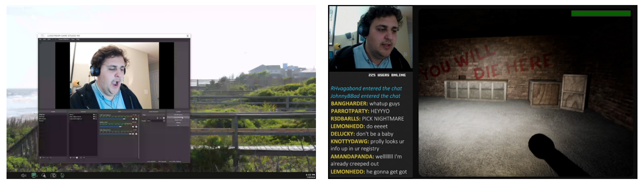
Illustration 9 : Scott sets up his stream and the movie's standard visual configuration. Frame grabs from Livescream.

the screen-within-a-screen to bring the potential dangers of the digital domain not only into the diegetic users' homes but also the extradiegetic viewers'.