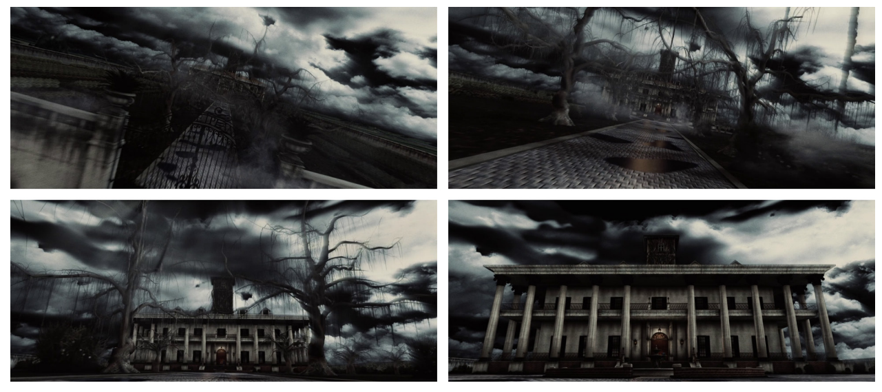
Illustration 6 : The visual construction of Gerouge Plantation drips with southern gothic imagery. Frame grabs from Stay Alive © Spyglass Entertainment, 2006.

The virtual camera moves through a foggy alley of leafless trees with dark clouds looming on the horizon, tapping into the aesthetics of "lushness flecked with decay" so typical of the southern gothic (Illustration 6),<sup>39</sup> while the very setting of the plantation evokes "the displacement and extermination of native populations, the forced exile and enslavement of millions of Africans, the tragedy of the Middle Passage, [and] the ravaging of peoples and lands."40 The camera approaches an antebellum mansion (Illustration 6), which traditionally figures as "a house of bondage replete with evil villains and helpless victims, vexed bloodlines and stolen birthrights, brutal punishments and spectacular suffering, cruel tyranny and horrifying terror,"41 to catch sight of a white male character who is about to enter the building. From here on, the perspective switches between first-person shots evoking the character's point of view and third-person shots showing him navigating the labyrinthine house. Ghosts appear in mirrors, while the bass-heavy sound of a beating heart and other uncanny sound effects support the atmosphere of dread and horror. A female figure starts chasing the character, eventually pushing him off the stairs, his neck gets tangled up in chandelier chains, and he dies, leading to a "Game Over" screen.