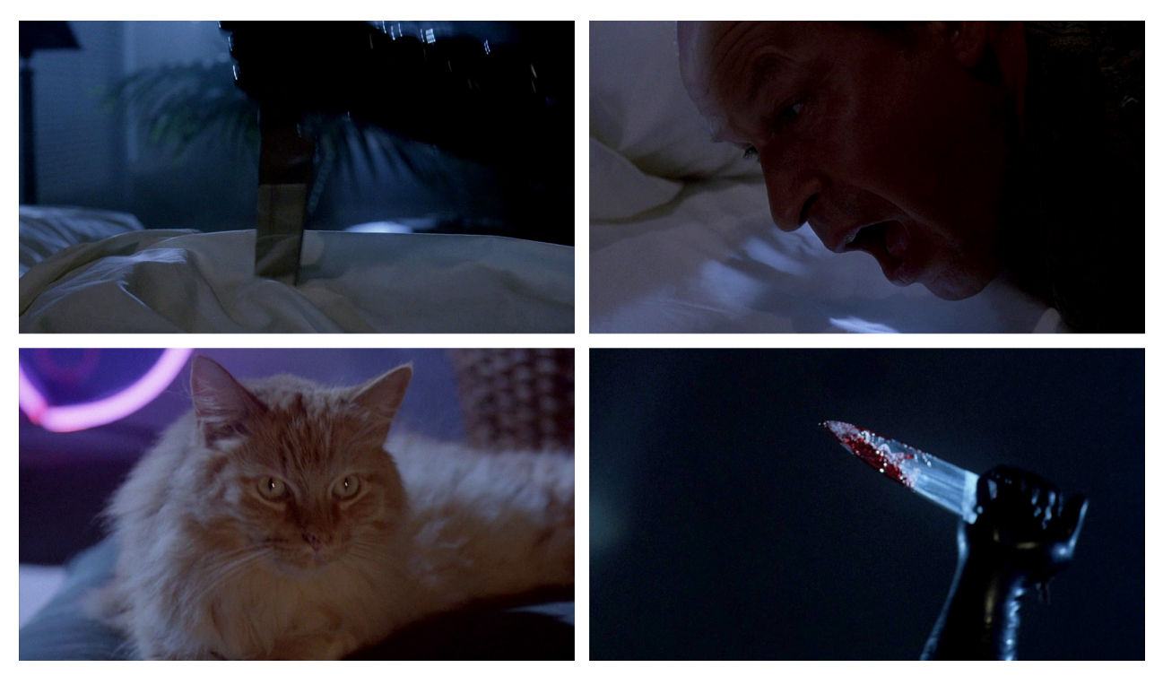
Illustration 5 : During the first murder scene, Brainscan repeatedly departs from the killer's point of view. Frame grabs from Brainscan © Triumph Releasing Corporation, 1994.

During the first murder scene, the movie repeatedly departs from the first-person perspective to focus on the knife and particular moments (Illustration 5), raising the question whether the audience of the movie can see what Michael sees (meaning that the videogame would turn to cinematic means to highlight particular aspects of the scene) or whether the movie departs from Michael's point of view to decidedly distinguish the film from the remediated experience of play. Viewed from the perspective of media rivalry, cinema could thus be said to showcase its superiority over videogames, as the movie incorporates the videogame. Such an argument would, however, be somewhat shortsighted because, as Sebastian Domsch has explained, "The video game is a meta-medium... that... allows the non-reductive incorporation of all other major [re]presentational media: spoken text, written text, as well as all kinds of sounds and images, both still and moving. Neither a written text nor a movie clip is lessened in their medial form by being part of a video game."<sup>32</sup> When a movie incorporates a videogame, on the other hand, it necessarily strips the videogame of