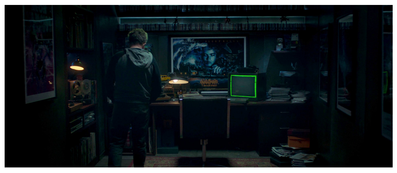
Illustration 10 : Hal's man cave evokes nostalgia for the 1980s. Frame grab from Choose or Die © CURSR Films Limited, 2022.

Dan Hassler-Forest has called the "nostalgia industry" has successfully (in economic terms) been mining the 1980s,<sup>76</sup> for which, in turn, the 1950s were "the privileged lost object of desire."<sup>77</sup> Fredric Jameson famously associated nostalgia with the "new depthlessness" of postmodernism,<sup>78</sup> but in Choose or Die , knowledge of the 1980s goes beyond the desire to revive an imagined past or return to an imagined past, as the past offers the means to solving the puzzles with which the characters find themselves confronted.