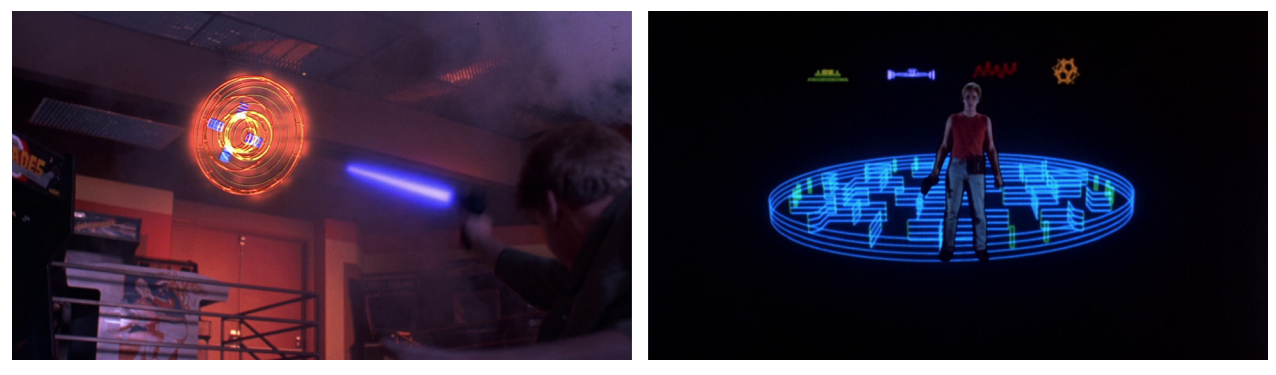
Illustration 2 : Hypodiegetic and diegetic worlds segue into one another. Frame grabs from Nightmares © Universal Pictures, 1983.

tologists refer to the type of "paradoxical transgression of, or confusion between, (onto)logically distinct (sub)worlds" that characterizes these movies as metalepses.<sup>19</sup> Although not mutually exclusive, I consider Alexander Galloway's notion of interface effects that emerge from the "mysterious zones of interaction that mediate between different realities" more productive for my discussion, as it emphasizes that interfaces "bring about transformations in material states" and are "the effects of other things, and thus tell the story of the larger forces that engender them."20 The configurations of mutually influencing worlds and sub-worlds in the films discussed in this article demonstrate that "every act of mediation ... can evoke a Gothic conflation of overlapping temporalities and realities."<sup>21</sup> By exploring the interactions between videogame worlds and "reality," these movies do not simply project anxieties onto digital games, but rather reflect on videogames' media-specific affordances, inquire into discourses surrounding videogames, and explore game cultures. I am particularly interested in the strategies and aesthetics of remediating videogames in the horror films and the conceptualizations of videogames and game cultures thus produced, as well as the larger cultural fears and anxieties (and hopes and dreams) that these representations evoke.