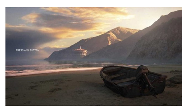
Illustration 3 : The main menu changes upon completing the first playthrough. Screenshots from The Last of Us Part II © Sony Computer Entertainment, 2020.

produced to accompany the many real-life Frontier expeditions of the nineteenth century.<sup>22</sup>