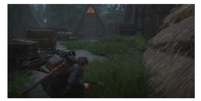
Illustration 1 : The small communities evoke the American Frontier. Screenshots from The Last of Us © Sony Computer Entertainment, 2013, and The Last of Us Part II © Sony Computer Entertainment, 2020.

go hunting and protect the community from outsiders' attacks. Despite emphasizing this dimension, I do not wish to downplay the overall importance of the decisions made by TLOU's creative team in terms of gendered stereotypes. In TLOU2, the player experiences life in the settlement in more than just brief glimpses, and it is quite evident that the developers put some effort into showing that not only men go out hunting and patrolling, and not only women take care of the community. Within